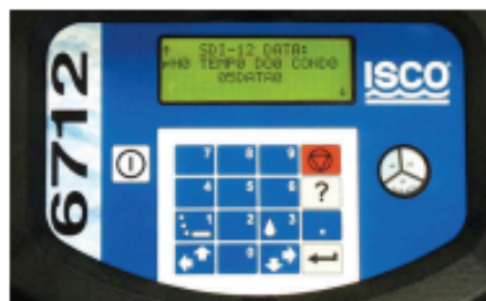
The 6712 Controller is also an SDI-12 data logger, and has many optional capabilities. Please contact ISCO or your ISCO distributor for more information.