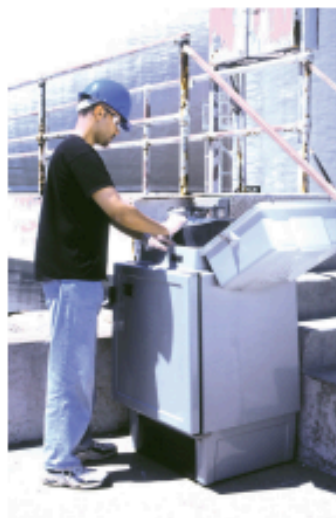
The 6712FR provides long service life in corrosive environments, and can be used outdoors without an enclosure.

The 6712FR uses thick, foamed-in-place insulation to keep samples preserved at the EPA-recommended 39 °F (4 °C). An automatically controlled, built-in heater ensures that samples won't freeze, even when ambient temperatures drop to -2 °F (-29 °C). Coolant is environmentally safe R134a. Durable powder-coated epoxy, phenolic paint, and polyester tubing, protect refrigeration components against corrosion.