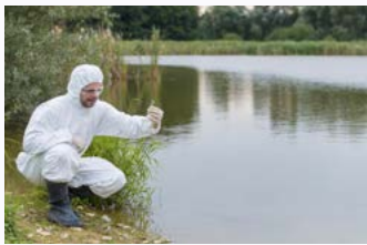
Pollution & Environment