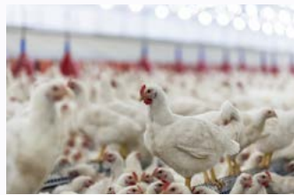
Food / Pharma / Veterinary / Industry