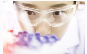
Research & Development